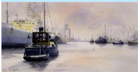
'Puffer' on the Clyde

At the Autumn Exhibition the most public votes went to Brian Garbett's watercolour painting entitled 'Puffer' on the Clyde, Glasgow' shown below.